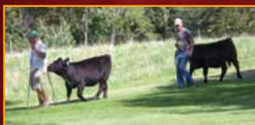
It's a family thing...