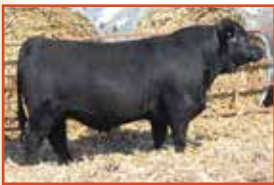
HL/BMR Duracell C139

Here is a super baldy Step Up daughter going back to a super functional Grizz female. Due the end of February to Uno Mas. That combo will be one to watch!