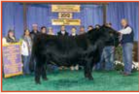
WLE Uno Mas