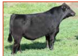
SS/PRS Trackin Tail 461A Sire

W/C Wide Track 694Y SS/PRS Trackin Tail 461A KenCo Miley Cottontail O C C Emblazon 854E Drake Miss R378U Drake Miss 378R