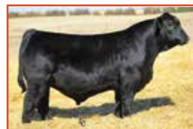
CCR Wide Range 9005A A.I. Sire to Lot 67

SVF Steel Force S701 VPF Red Steal SS Ebony's Reflection VPF No Worry VPF Chick A Boom Sweet Cherry Wine