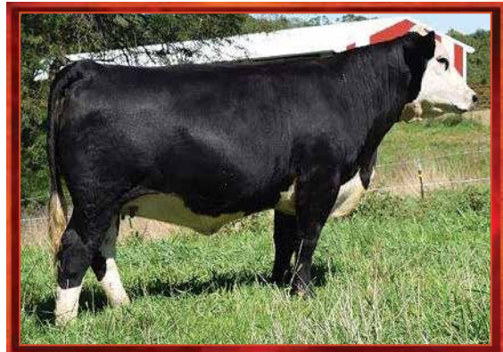
Coleman Engage 5255, A.I. Sire

A.I. Sire: Coleman Engage 5255 on 5-6-18