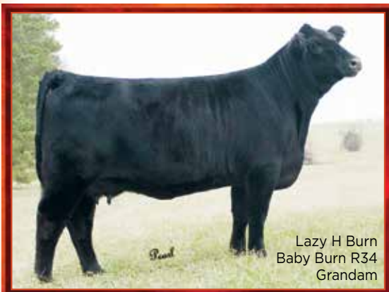
Lazy H Burn Baby Burn R34 Grandam

This female is out of a daughter of Lazy H Burn Baby Burn R34 and she has delivered on her first calf. This young heifer is a broody tank, with style and eye appeal. With a great pedigree and solid numbers, this will be a safe investment for someone.