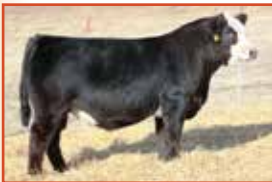
W/C Lock Down 206Z A.I. Sire to Lot 71 & 72

This solid black, polled female is out of our ever popular Lazy H Lock N Load son. She exhibits all the qualities that his progeny have and is destined to make a good cow. Ultra sound confirmed she was bred to HL/BMR Duracell on June 12th, 2018. Duracell is our calving ease specialist who was a high seller at Heartand's bull sale a couple of years ago.