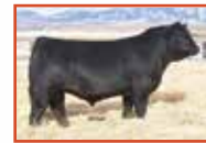
Koch Big Timber 685D A.I. Sire

Miss E89R is a black white face female sired by Upgrade U8676, Miss E89R's dam is a SimAngus™ cow that produce's in the top 20 percent for performance every year. There is no doubt this Upgrade daughter will deliver high performance cattle with longevity. Mated to Big Timber will be an exciting for an early calf.