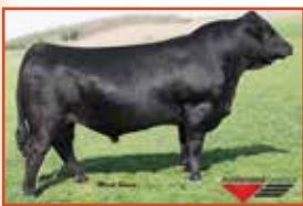
IR Range Boss Y623

This Range Boss daughter is exactly what we hoped for. She was born unassisted out of a first calf heifer. She exhibits plenty of depth and internal dimension in a feminine package. Be sure to check out her EPDs and her planned mating EPDs. We think this heifer has a world of potential. Ultrasound confirmed her being bred on June 7th, 2018 to HL/BMR Duracell. His calves to date have come unassisted and have not disappointed us.