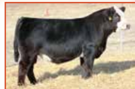
W/C Lock Down 206Z A.I. Sire to Lot 64

Mr. NLC Upgrade U8676 GLS Integrate Z3 GLS Miss BTE W149 Sand Ranch Hand WLM Ms. Ranch X245 RSF Ms. Macho 245R