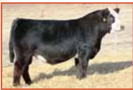
W/C Lock Down 206

A real neat made solid black percentage heifer with tremendous eye appeal and soundness. Very smooth down her top into a slick front. Moderate framed with abundant depth and bone.