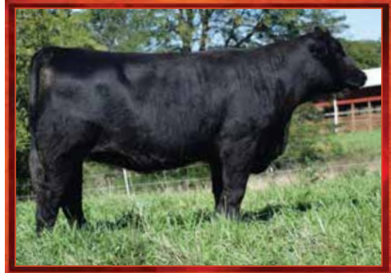
W/C Rapid Fire 2101C, A.I. Sire

A.I. Sire: W/C Rapid Fire 2101C on 5-4-18 Est. Plan Mating EPDs: 13 -.55 60 96 .22 6 29 59 16 11.65 Carcass: 30.35 -.33 .29 -.07 .75 130 70