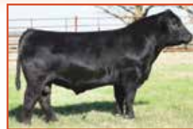
W/C Utah 6C

FB Prime Cut 456L Flying B Cut Above Dillons Ms. Pretty Woman 704 Macho