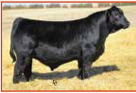
CCR Wide Range 9005A A.I. Sire to Lot 69