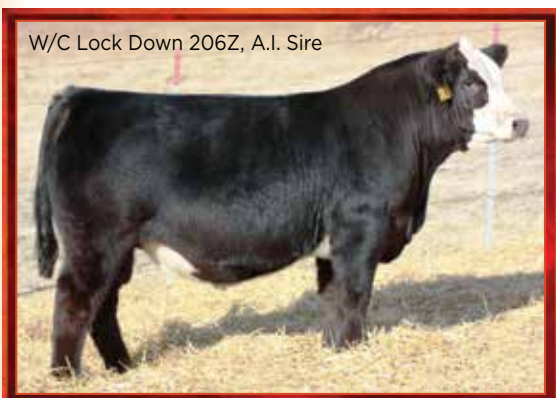
W/C Lock Down 206Z, A.I. Sire

A.I. Sire: W/C Lock Down 206Z on 4-25-18 Est. Plan Mating EPDs: 14 -1.85 66 104 .24 8 22 55 19 13.7 Carcass: 33.95 -.20 .22 -.03 .70 137 72