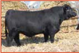
HL/BMR Duracell C139 Service Sire to Lot 70

SVF Steel Force S701 VPF Red Steal SS Ebonys Reflection DJ Salute G509 VPF Right X10 Drake Right About Now