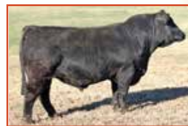
J Bar J Night 275Z A.I. Sire to Lot 68

Hook's Zero Gravity 103Z Cason's Mr. Weston Cason's Miss Denver HTP SVF In Dew Time Cason's Miss Z5 Sandy Acres 357X