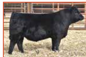
Hook's Black Hawk 50B A.I. Sire to Lot 65 & 66

W/C Wide Track 694Y SS/PRS Trackin Tail 461A KenCo Miley Cottontail SS Sleep Tight 69U Drake Miss R185A Drake Miss 185R